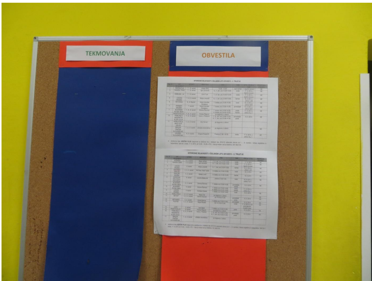
Information about competitions