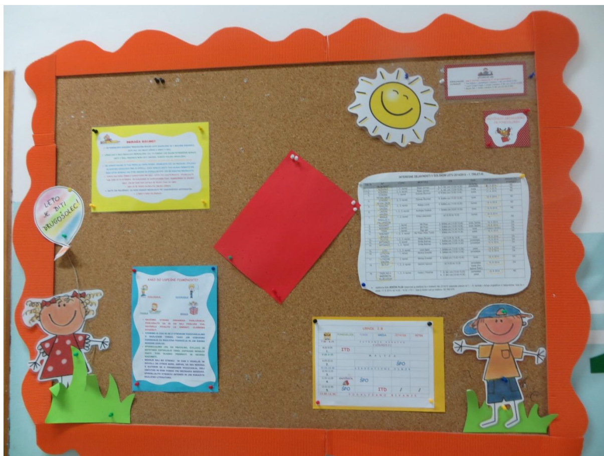
Information about different events, time tables for extra curricular activities, invitations for parents