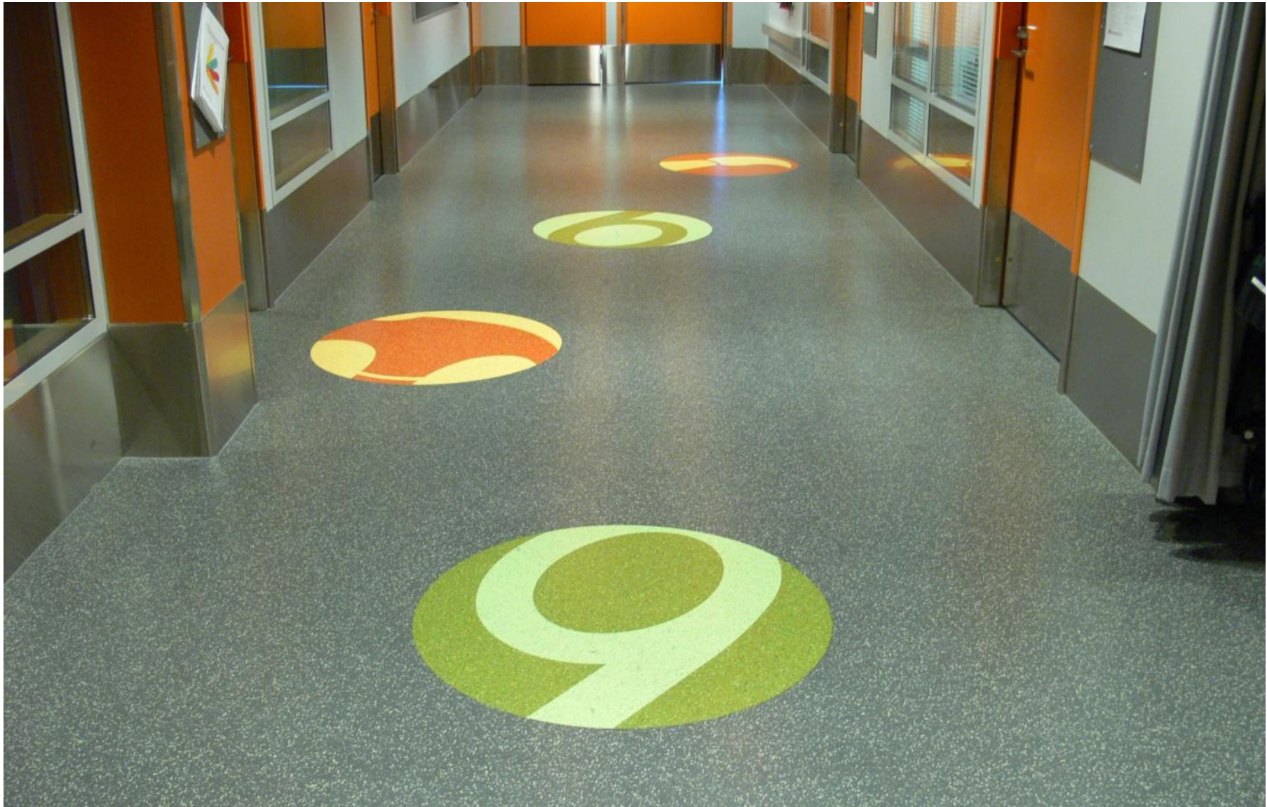
Markings on the hallway lead to the handicrafts classrooms.