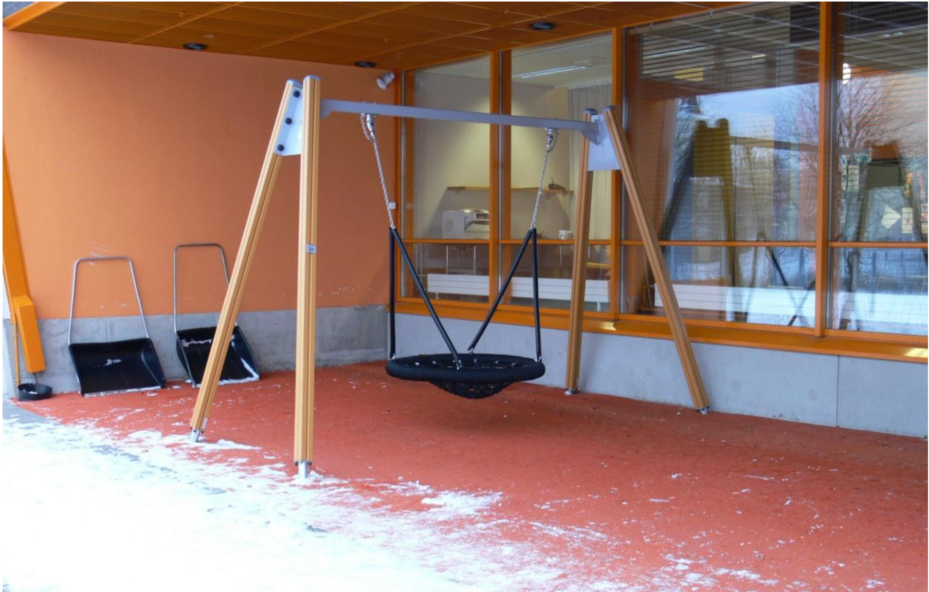
Swing set suited for all pupils. The set is placed under a shelter and on a safety surface.