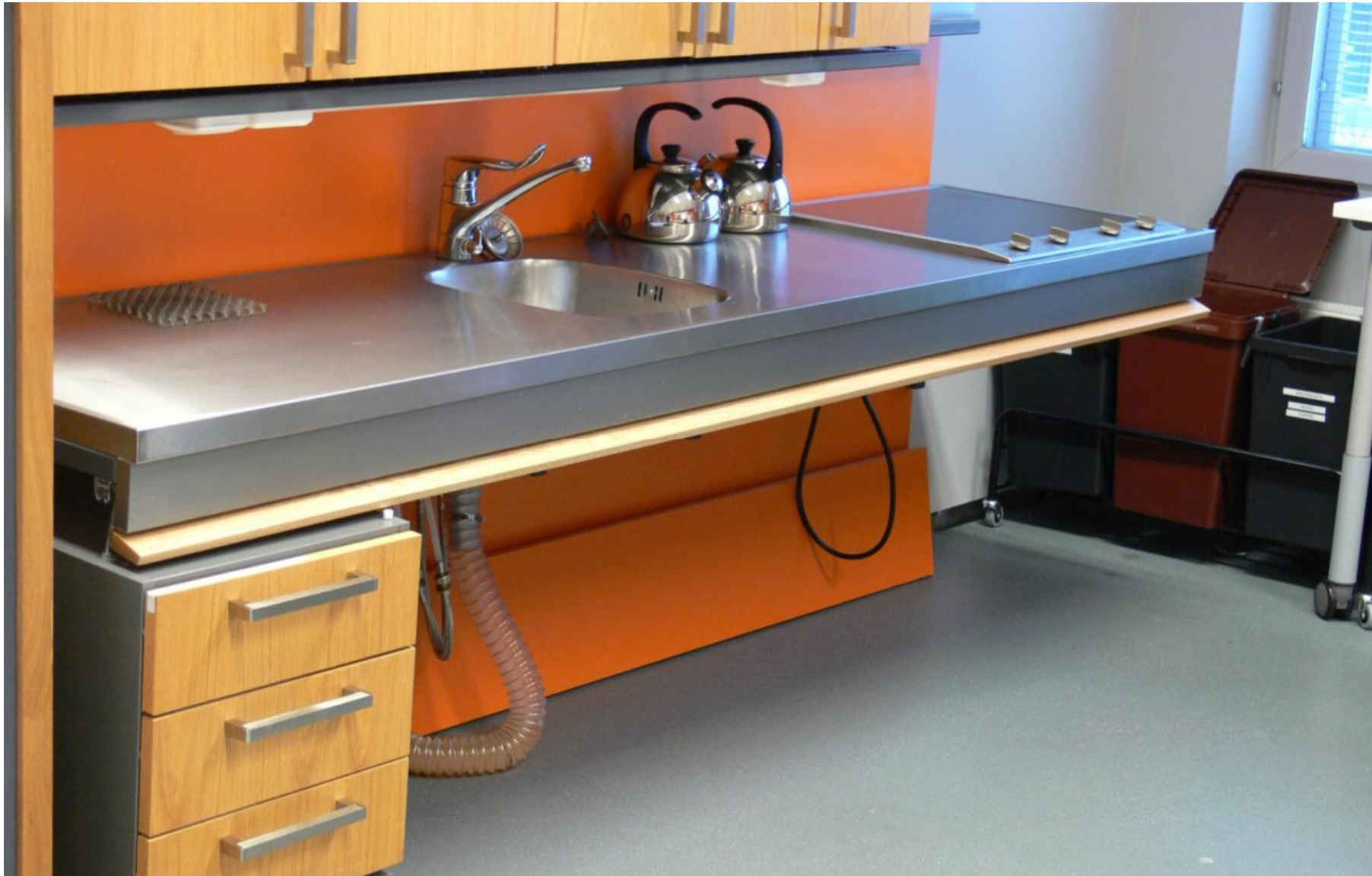
Electronically adjustable kitchen countertop in the combined home economics classroom and the residential home dining room.