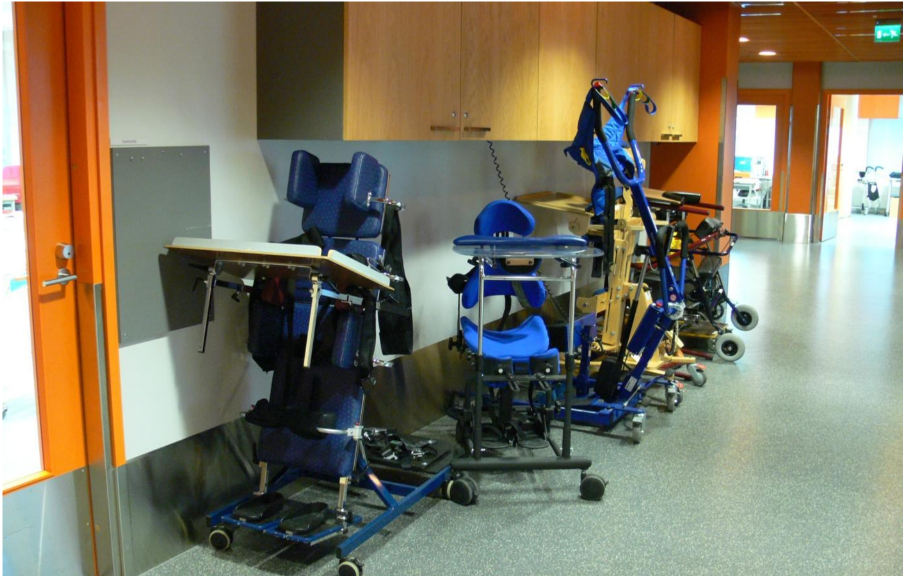
Space to store standing frames (part of them re-chargeable), work chairs, walkers of the pupils.