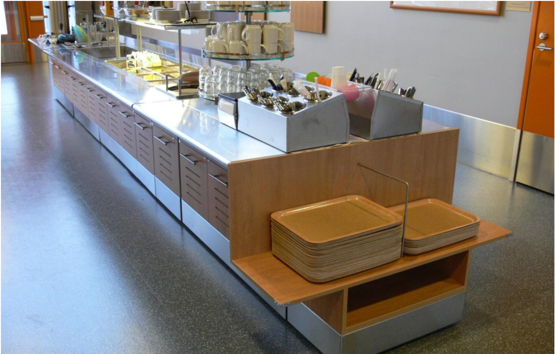
Lowered buffet line to enable small children and wheelchair users to select their meal independently.