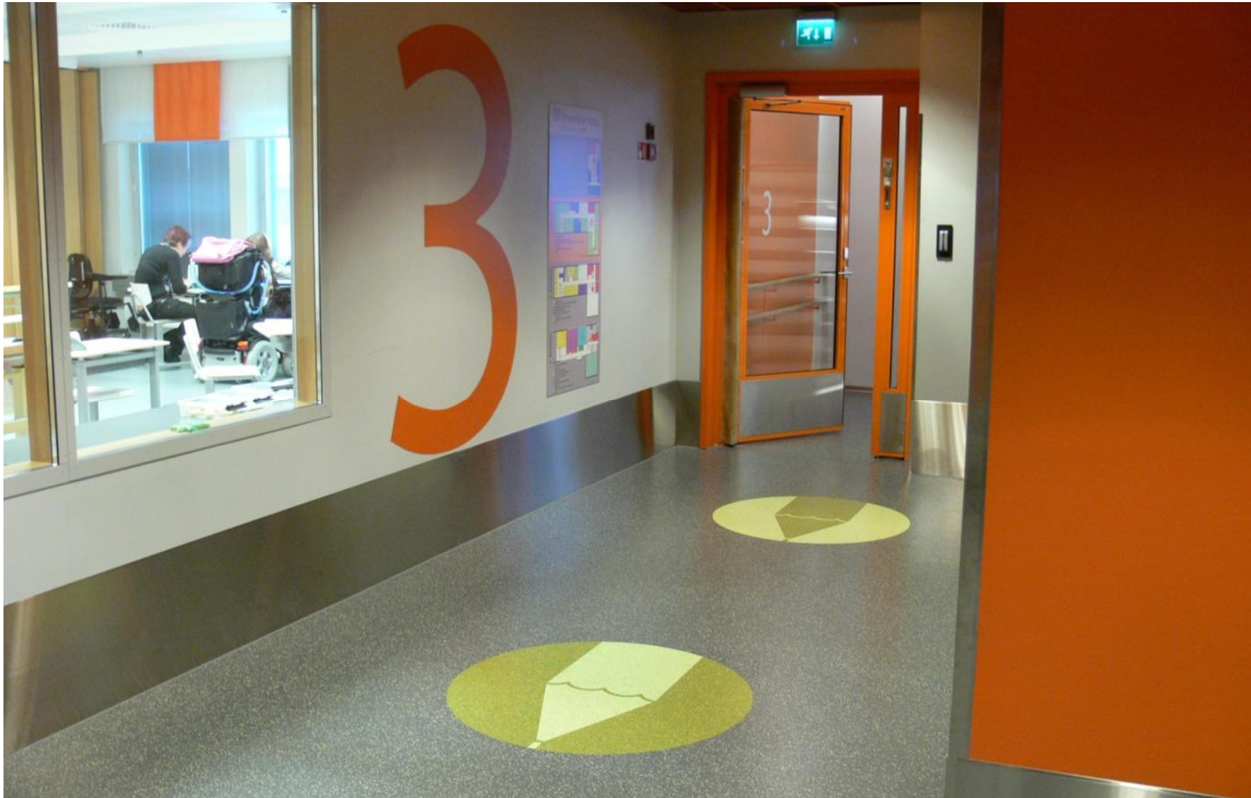
Large number on the wall indicates the floor number and the floor markings the purpose of the area. The large window provides more sense of space to the classroom.