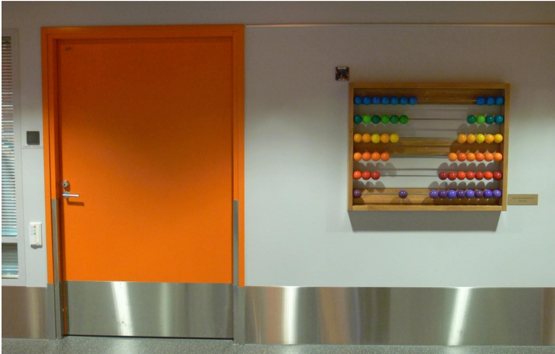
High contrast between the coloured room doors and the light walls. The bottom of the walls and doorframes are protected from moving-aid damages. Pearl art for the pupils to play with by artist Virpi Vesanen-Laukkanen.