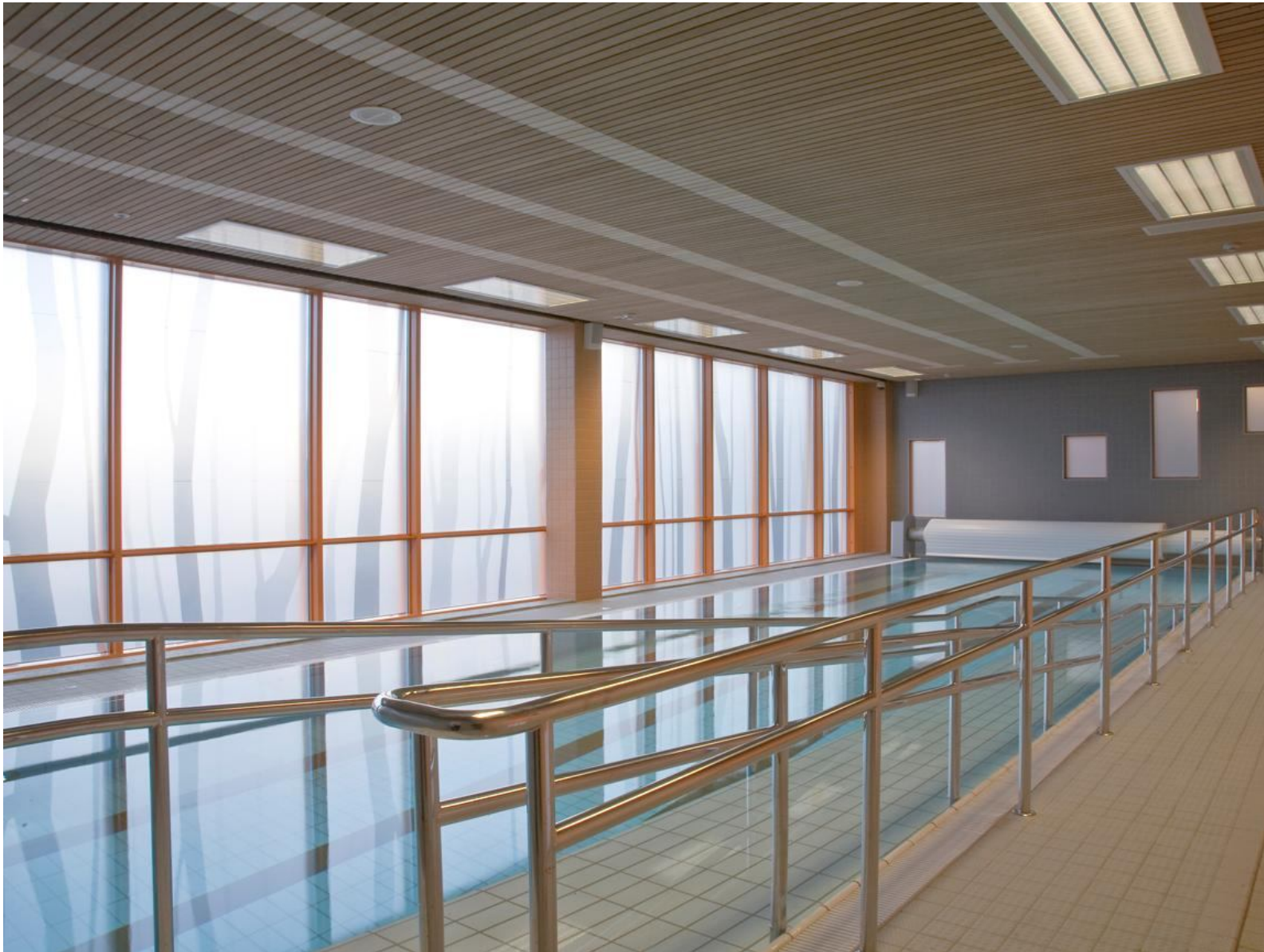
Therapy pool with ramp for shower chairs and on the back of the room electronic pool cover to prevent heat loss and humidity problems.