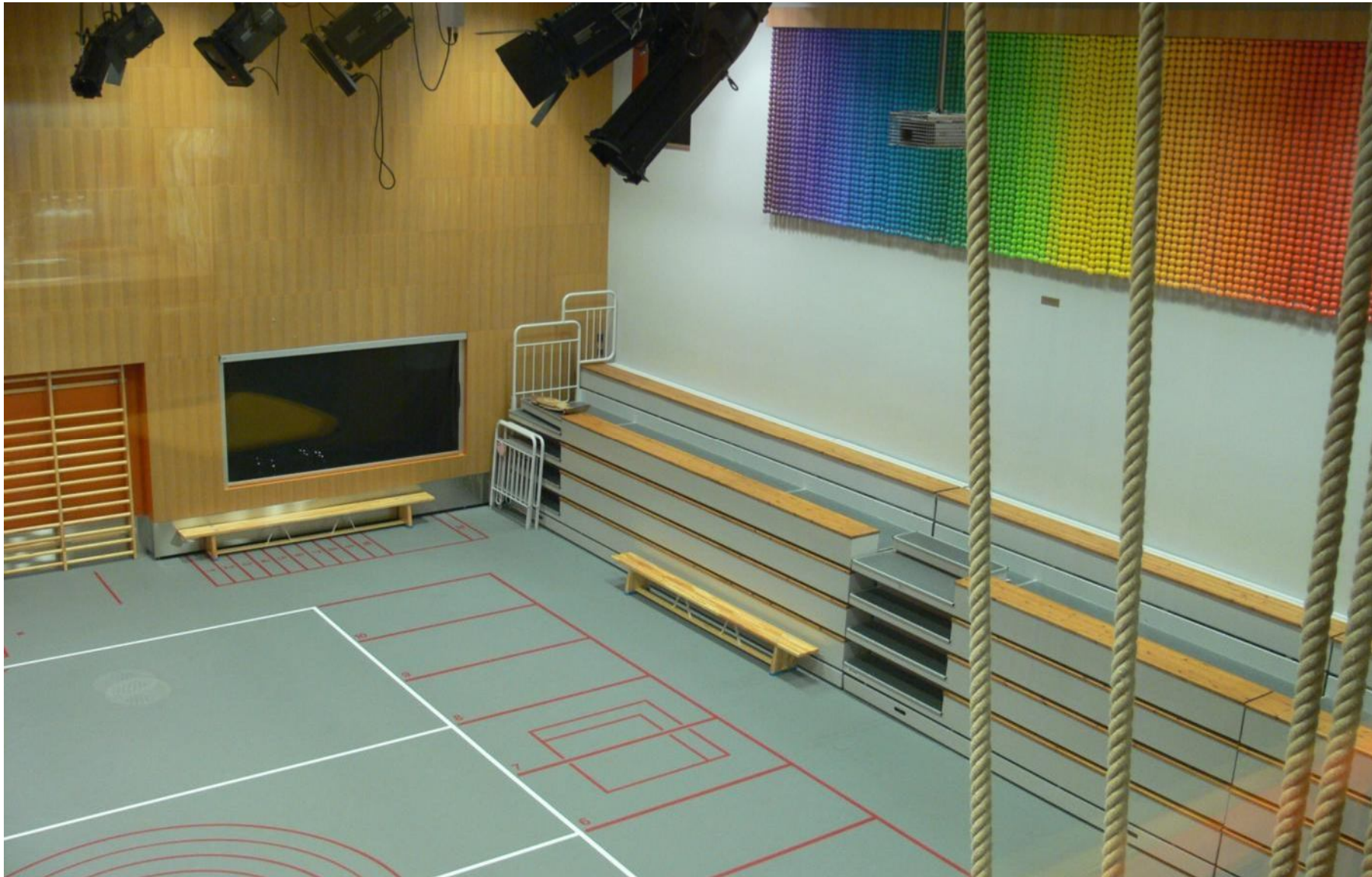
View to the PE hall: the floor includes court lines for certain sports; there is a retractable seating system on one side of the hall; art by Virpi Vesanen-Laukkanen on the back wall; spotlights and ropes suited for sensory integration therapy are hanging from the ceiling.