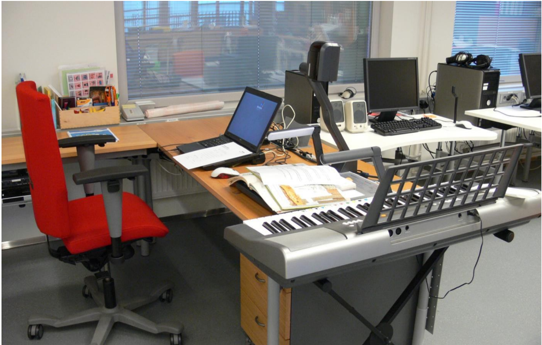
Teachers' working station with a laptop computer, a document camera and an electronic piano.