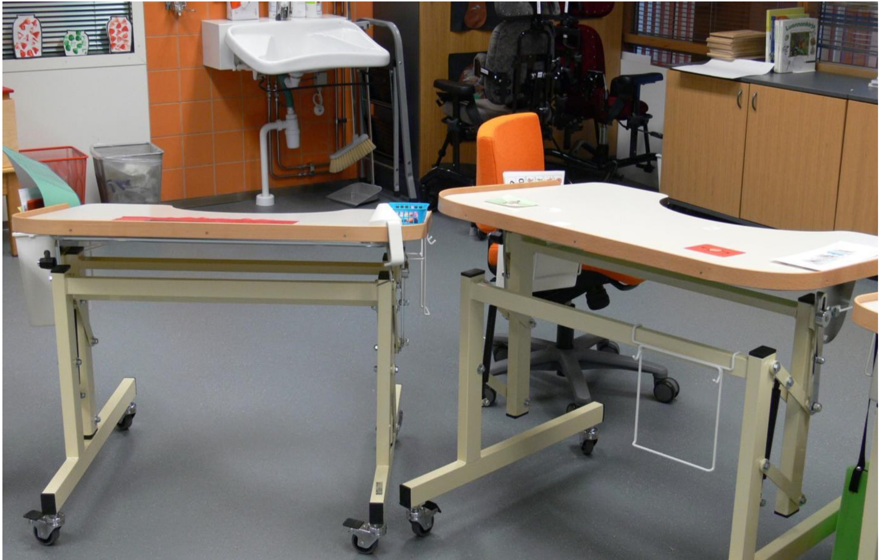
Pupils' desks. In the background, there is a height-adjustable sink.