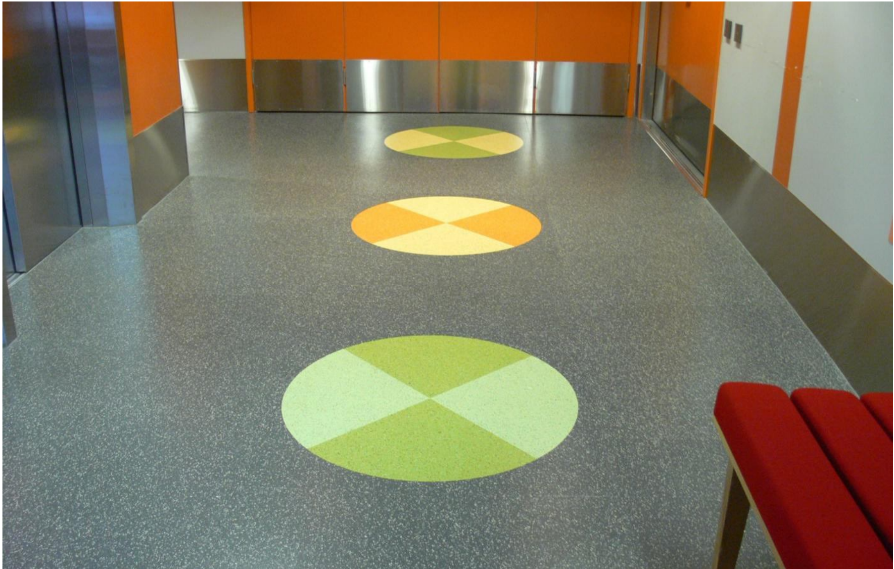
Floor markings leading to the PE hall.