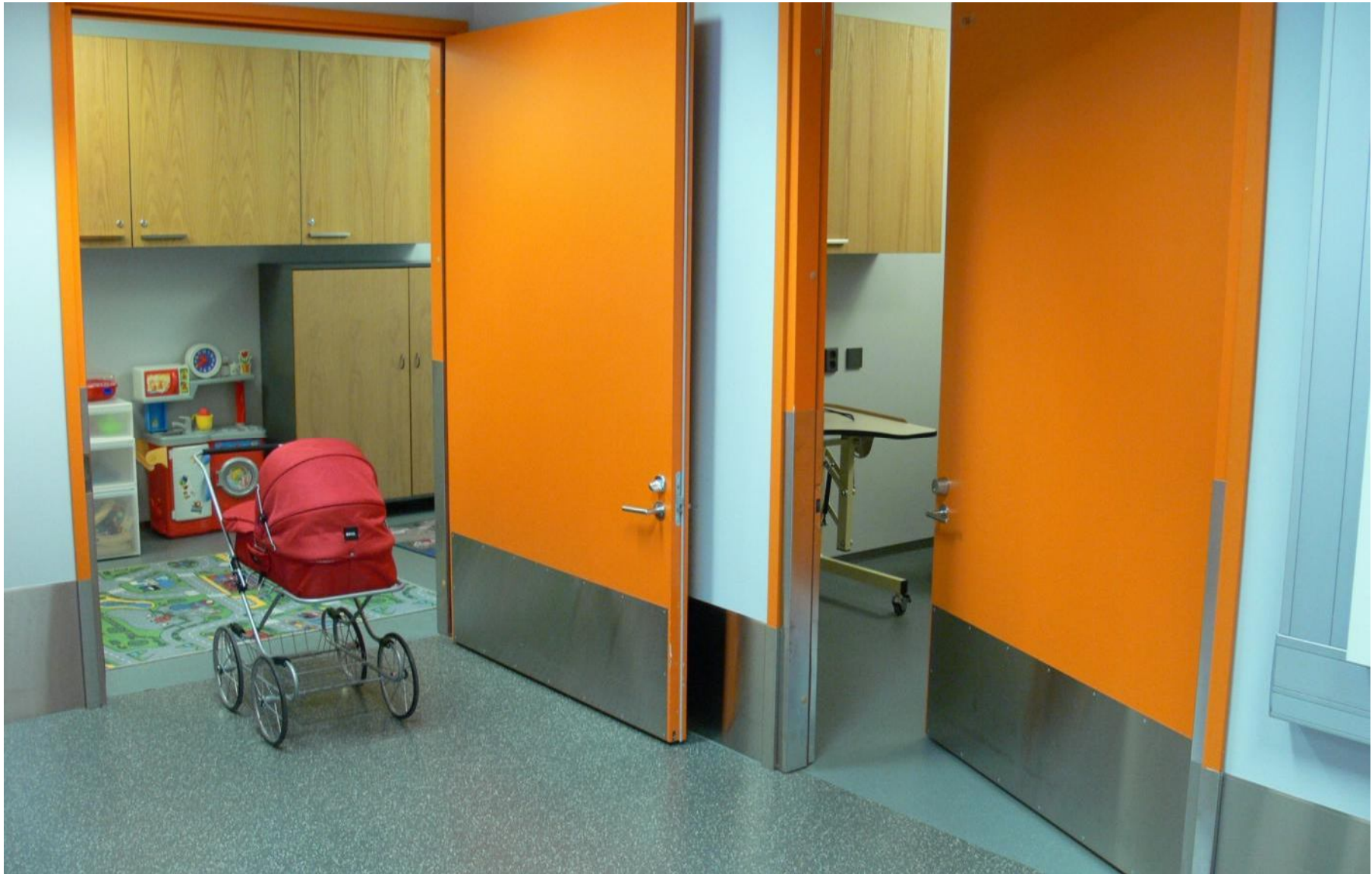
120 cm wide doors facilitate accessing to classrooms and playrooms