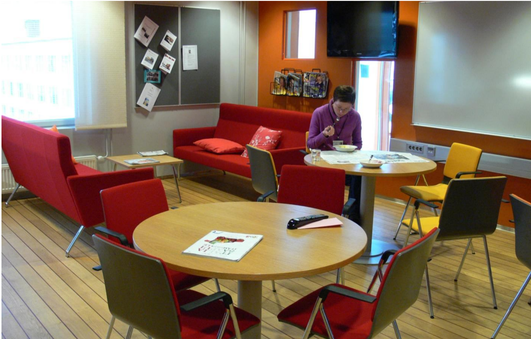
Staff resting room, in which all staff members of different professions can meet each other during the working hours.