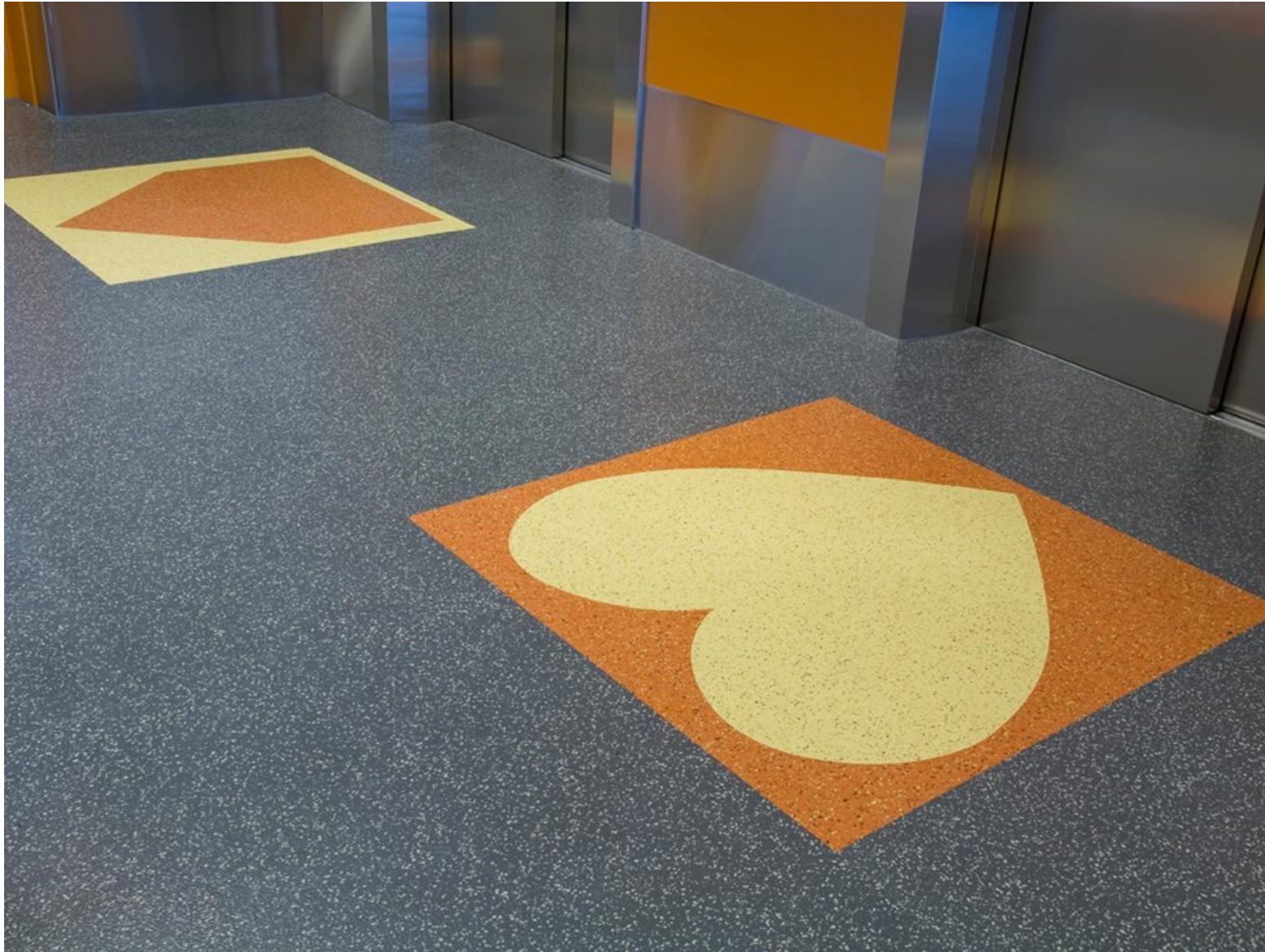
Marking indicating positive feeling and building (adapted from Blissymbols) on the floor of the residential home hallway.