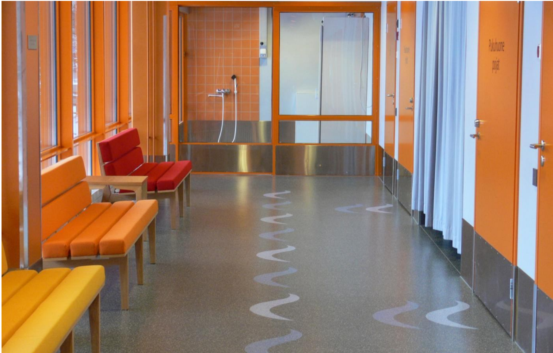
Automated sliding doors lead to the hallway with clear markings on the floor to indicate the location of the therapy pool. In the back of the picture there is a cleaning possibility for the wheelchair wheels.