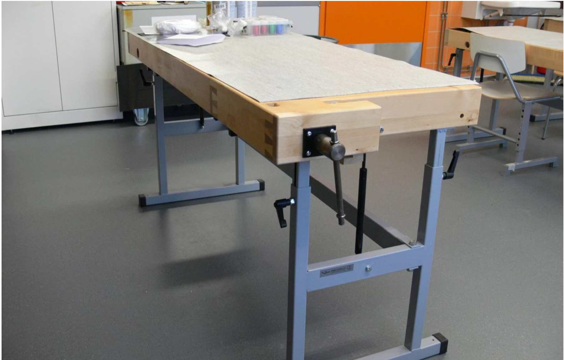
Height-adjustable carpenter's bench with open foot space in the handcrafts classroom.