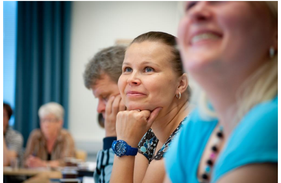
Learning and Consulting centre